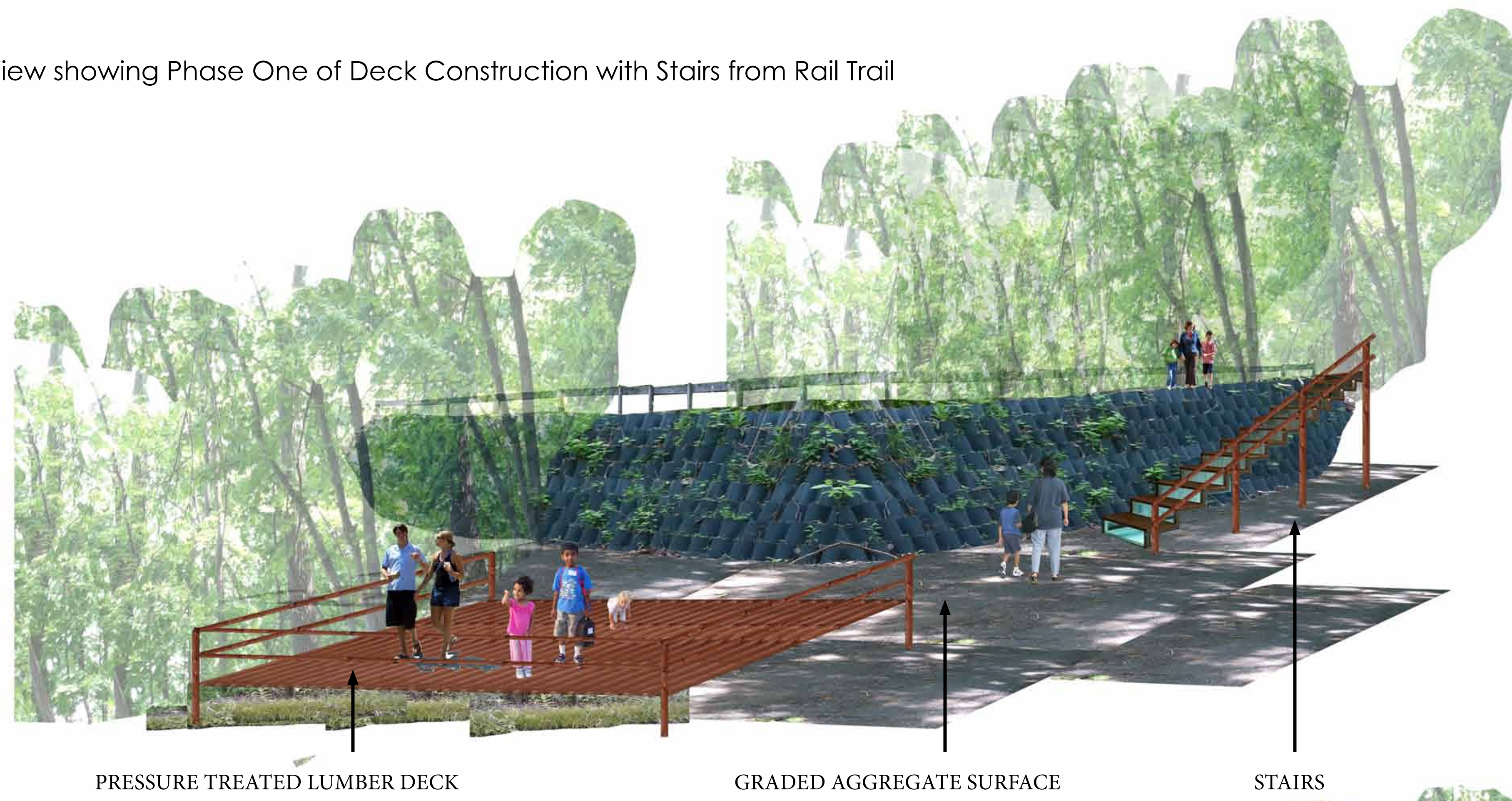
PRESSURE TREATED LUMBER DECK