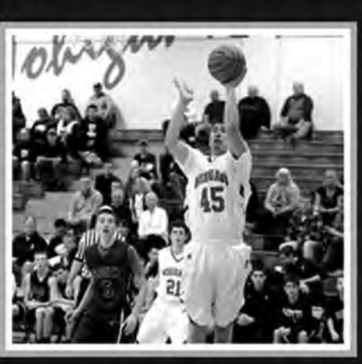
MHS vs Parkersburg South By Ron Rittenhouse 1/10/2014